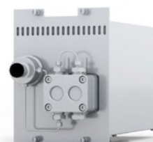
AZURA® Pump P 4.1S