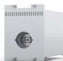
AZURA® Valve Unifier VU 4.1**