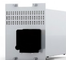
AZURA® Detector UVD 2.1S